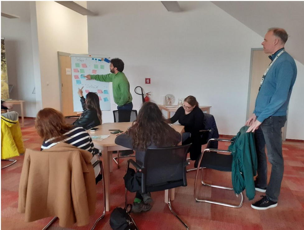
Summarising impressions at the end of the meeting