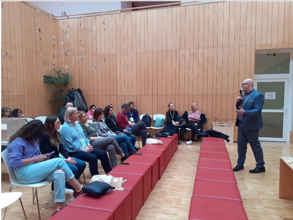
Deputy Mayor Andrej Mladenović