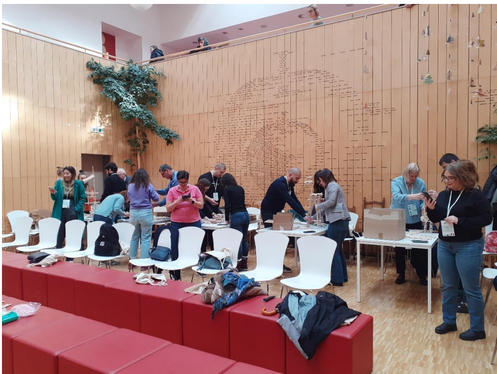
Participants learn about the local wooden didactic toy "Konstrukta"