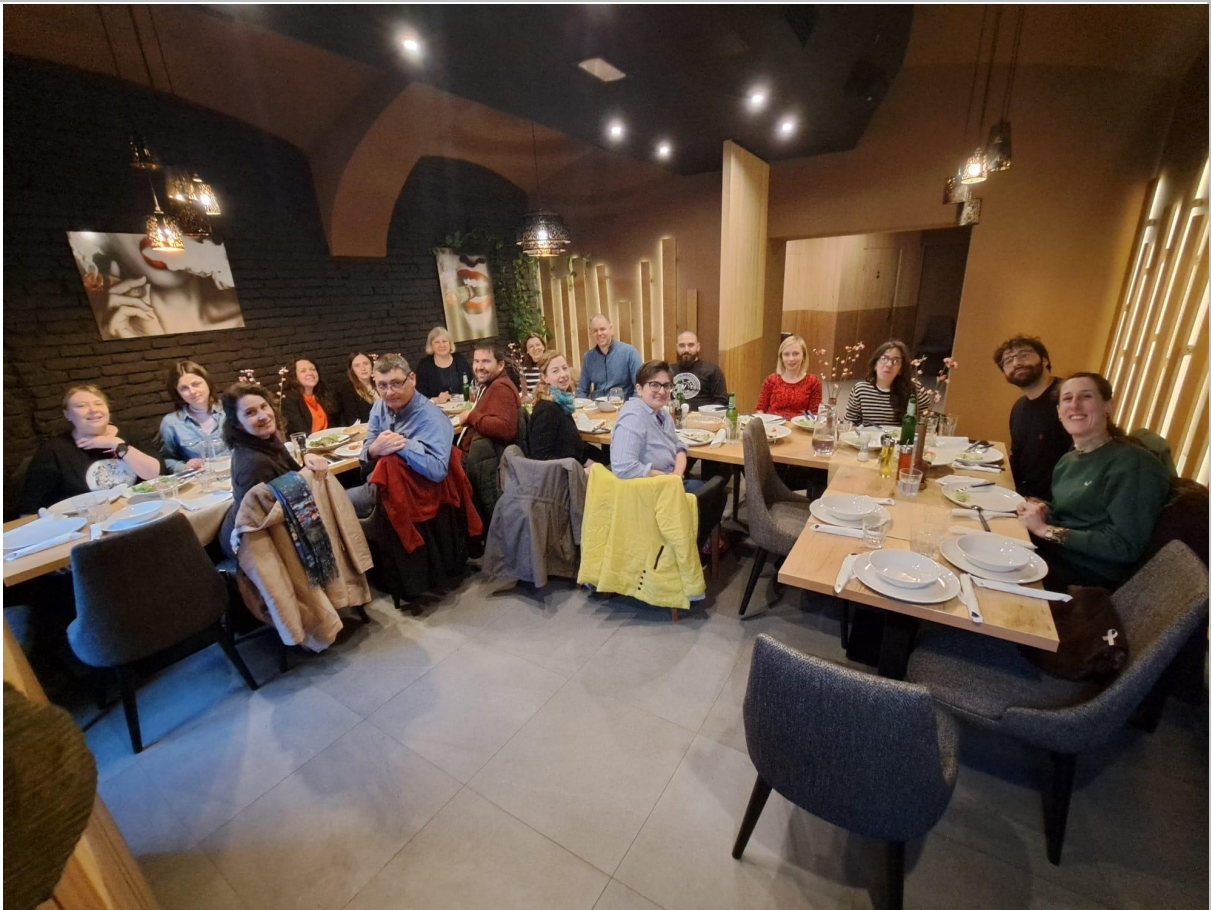
Closing dinner and last exchanges of impressions