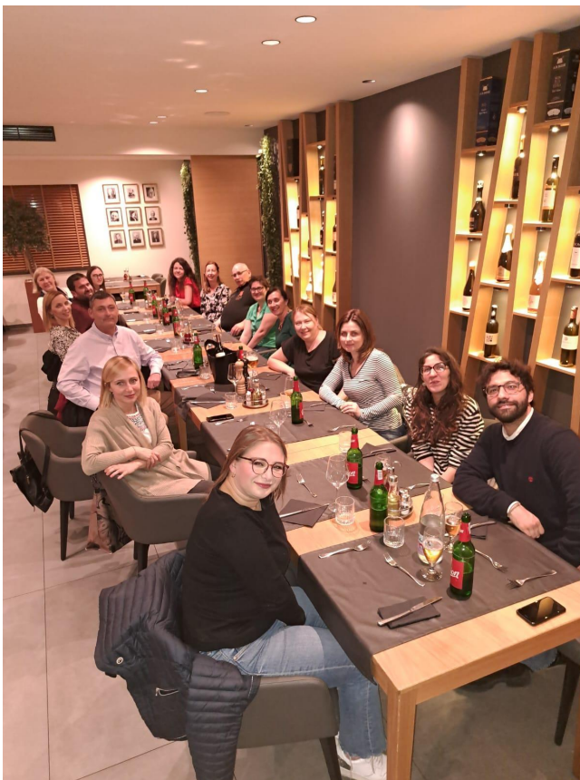
First dinner of project partners

* All persons appearing in the photos used for this report signed a photo release document giving consent and approval for their use.